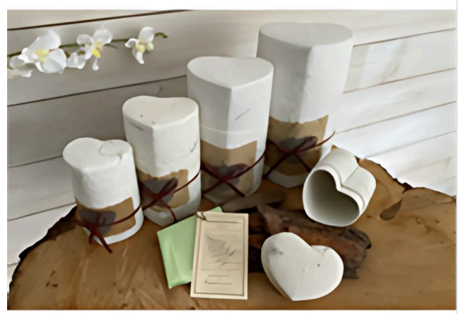
Peaceful Return Urn