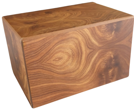
Wood Scattering Urn

Sales tax and Cash Advance Options not included